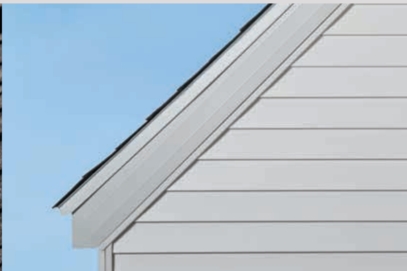
◀ At-eave application ▶