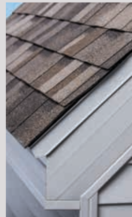
◀ Blends into roofline with a low-profile, 3-plane design ▼