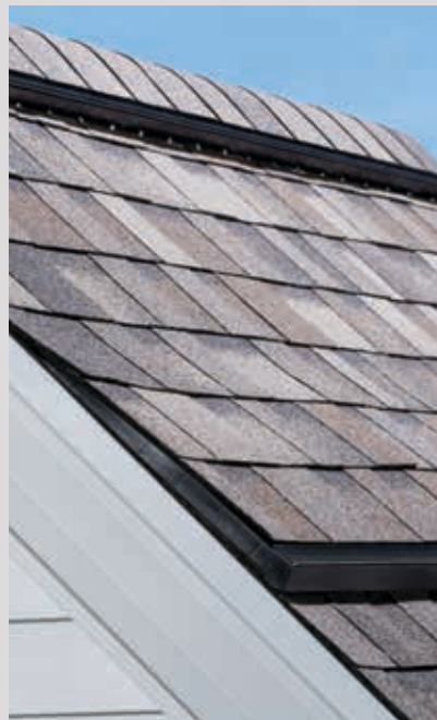
◀ Durable construction for long-lasting performance; mesh top minimizes debris collection