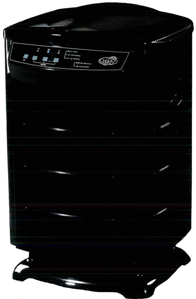
*Disinfecting Filtration System