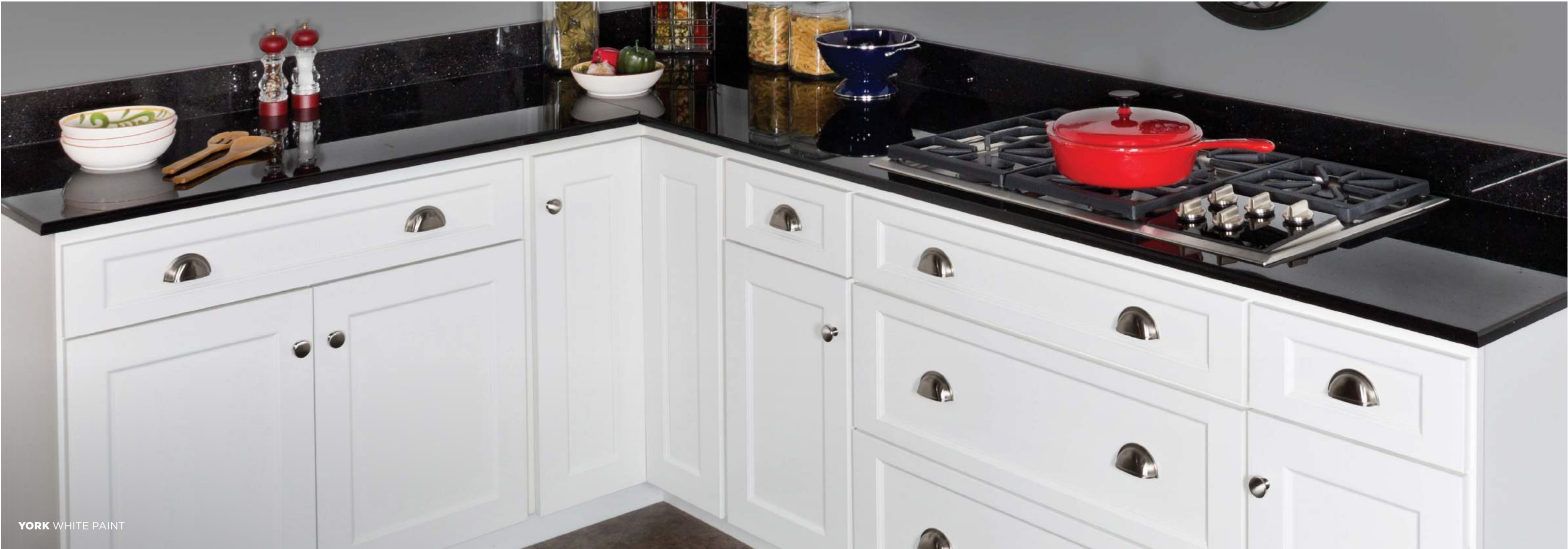
YORK WHITE PAINT