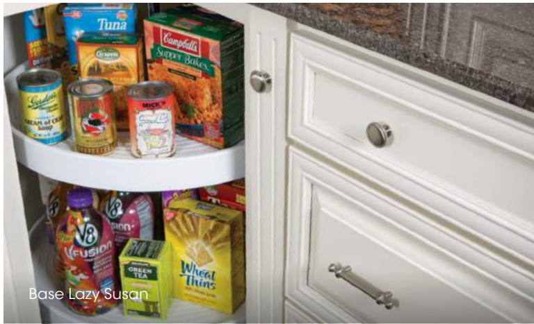
Base Lazy Susan