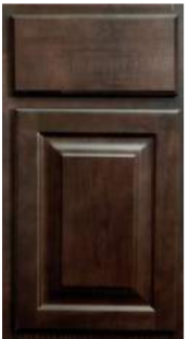
Dark Sable Stain