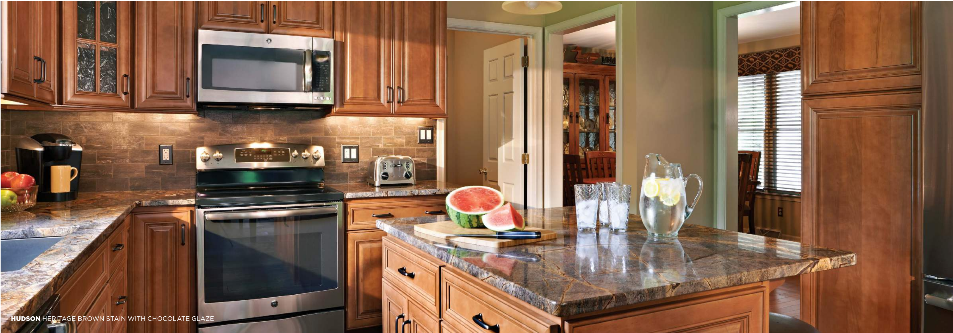
HUDSON HERITAGE BROWN STAIN WITH CHOCOLATE GLAZE