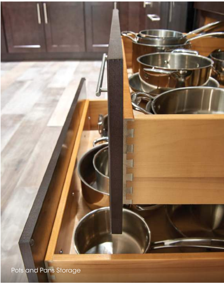
Pots and Pans Storage