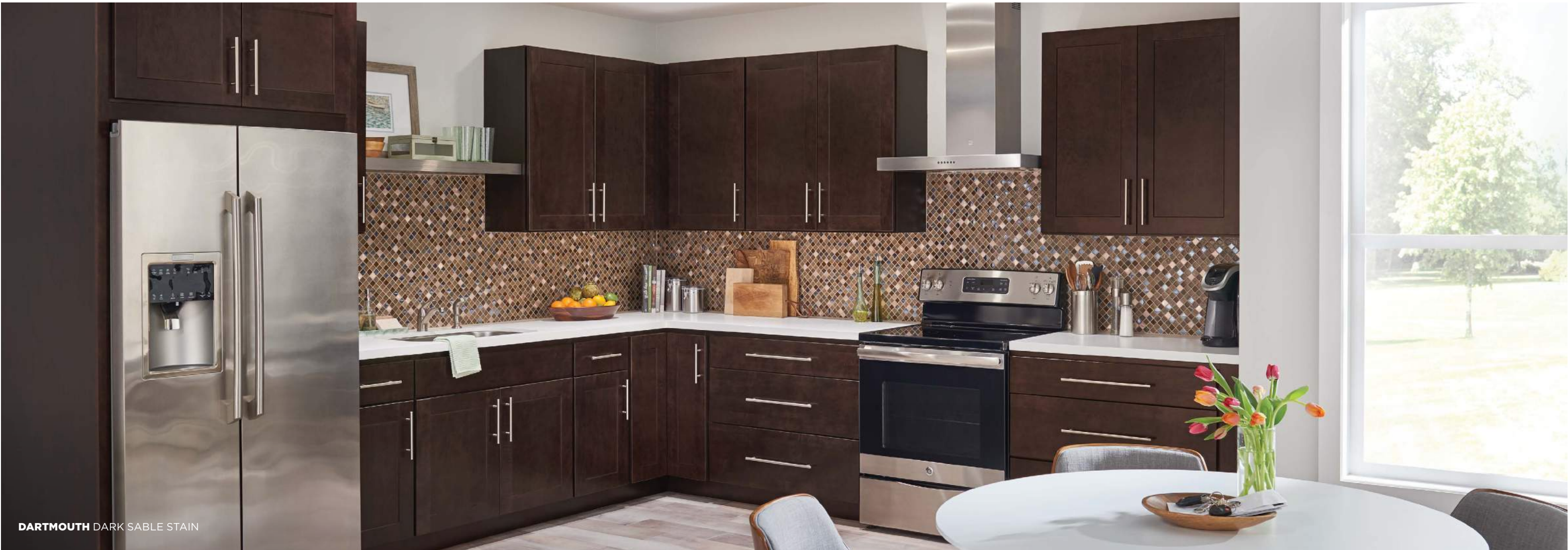
DARTMOUTH DARK SABLE STAIN