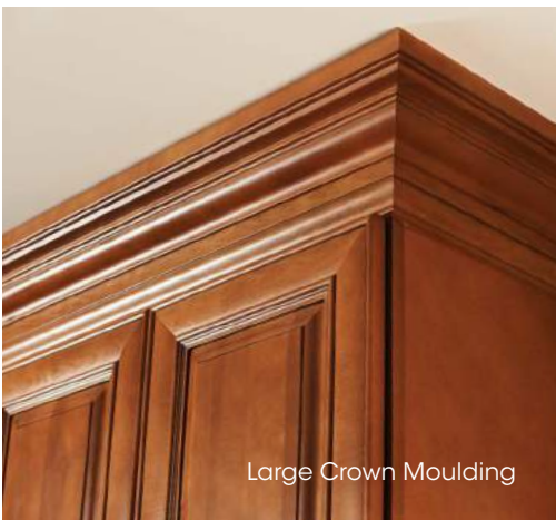
Large Crown Moulding