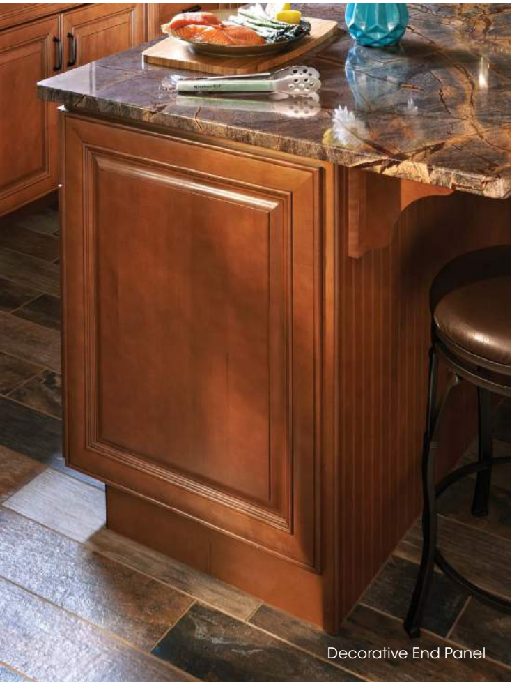
Decorative End Panel