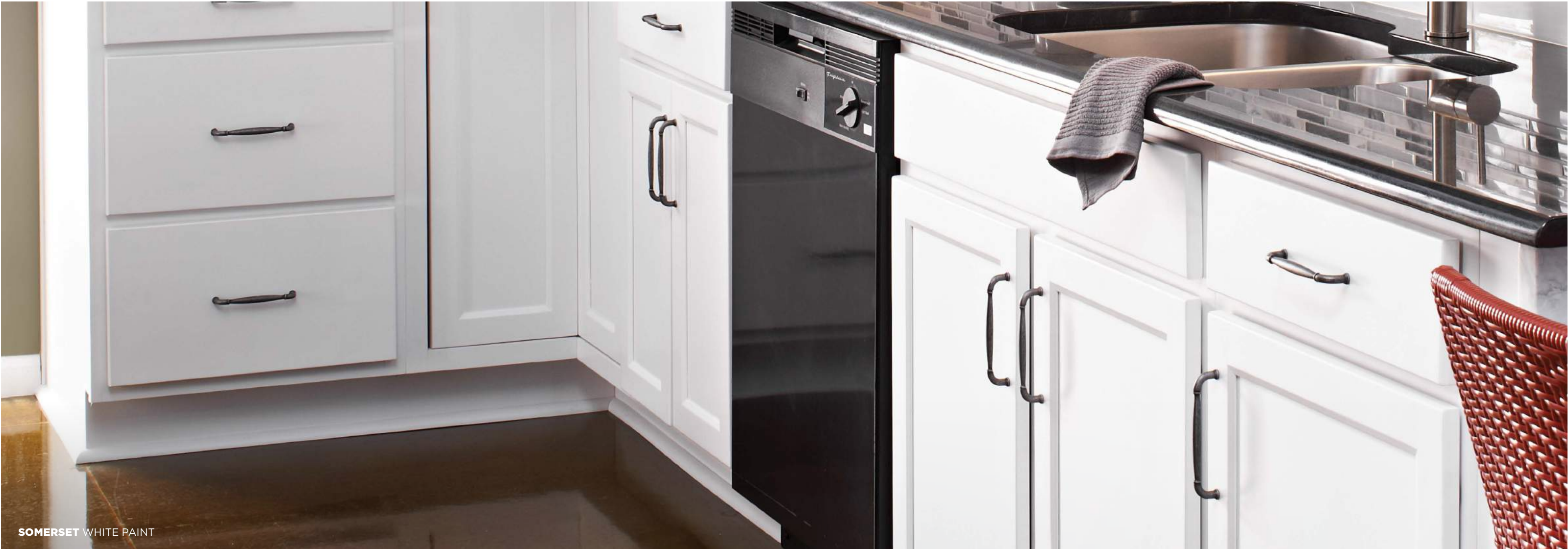
SOMERSET WHITE PAINT