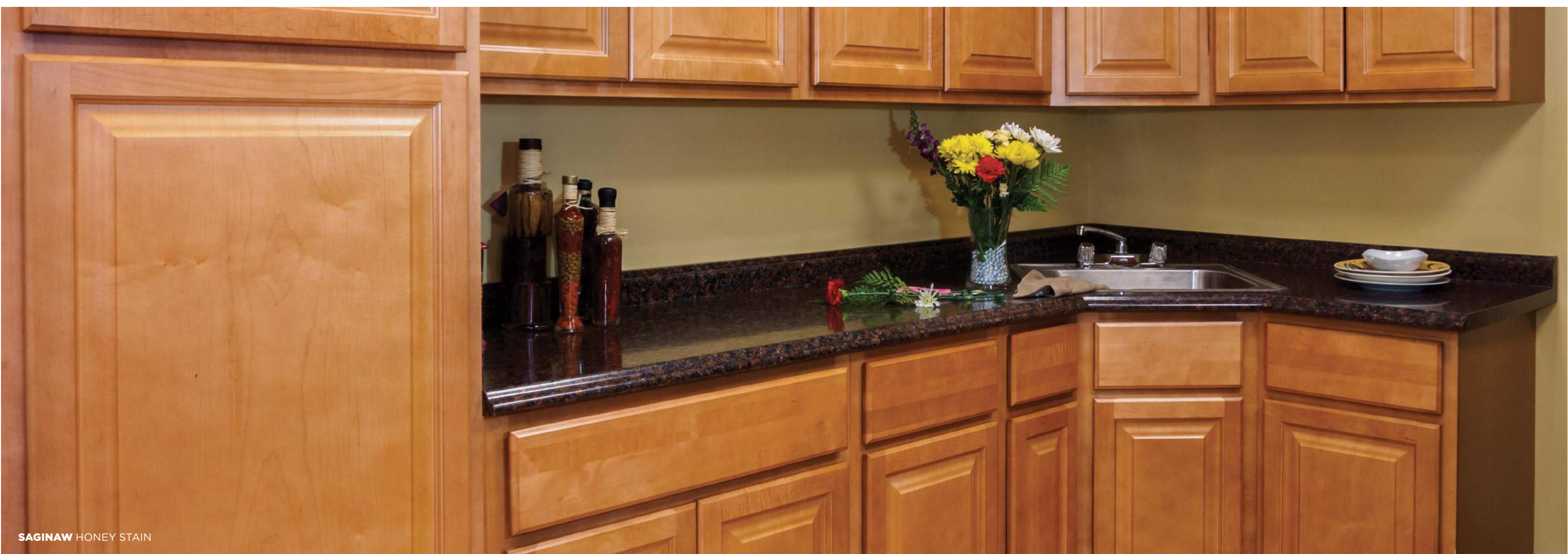
SAGINAW HONEY STAIN