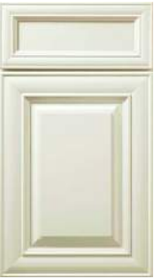
Antique White Paint

If you've been looking for the ultimate in classic all-wood cabinetry, your search is finally over. With a mitered pillow design and luxurious paint and stain finishes, our Hudson cabinets offer both timeless beauty and elegant styling.