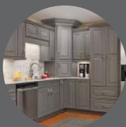
Kitchen & Bath

For a complete line of Wolf products, including these items and more, please visit our website.